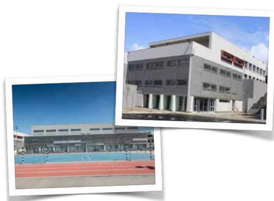
Escola Básica e Secundária de Canelas